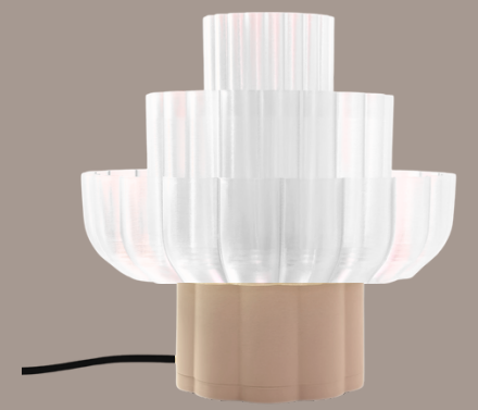
mocha mist beige matte & clear tranclucent